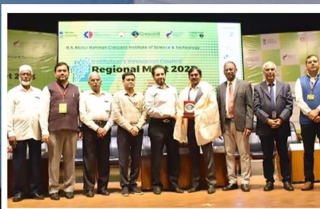
IIC Regional Meet page 03