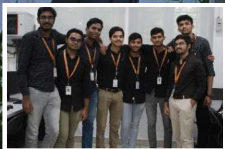
DevXperience page 01