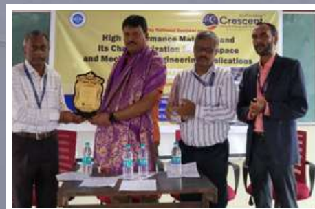
One Day National Seminar page 09