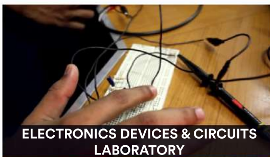
ELECTRONICS DEVICES & CIRCUITS LABORATORY