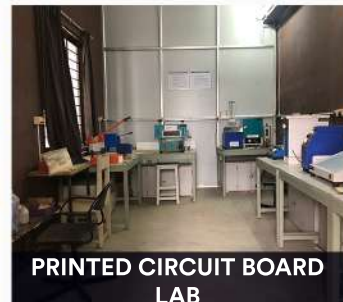
PRINTED CIRCUIT BOARD LAB