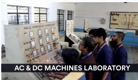
AC & DC MACHINES LABORATORY