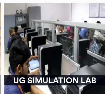
UG SIMULATION LAB