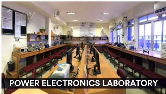
POWER ELECTRONICS LABORATORY