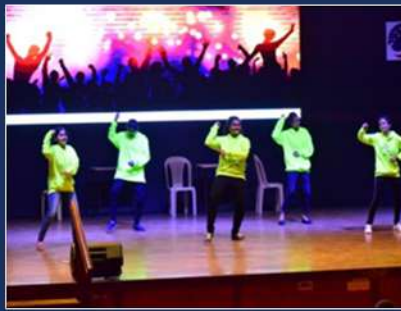
Students from second and final year performing to a dance number