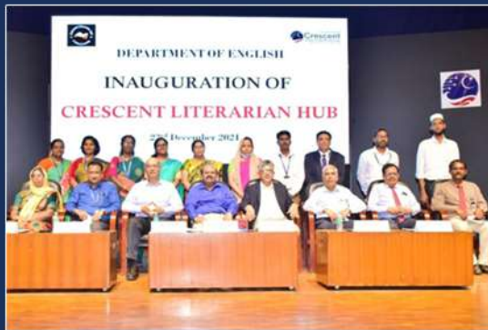
The faculty of the Department of English with the dignitaries