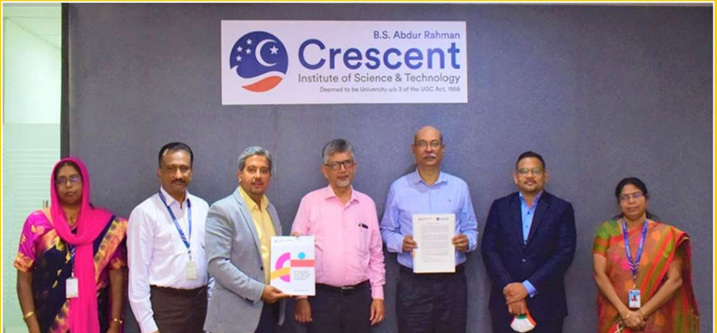
MoU with Cambridge Language Assessment in 2022

Our institution which has been functioning as BEC Centre since 2010 has been given the “Preparation Centre Award 2019-2020” for Continuous Excellence in recognition of conducting the exams as per the standards set by Cambridge Assessment English.