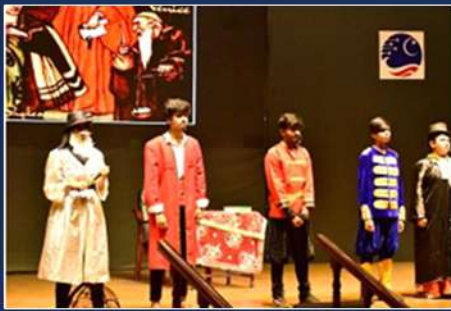
Students from final year B.A. English (Hons.) performing on stage The Merchant of Venice